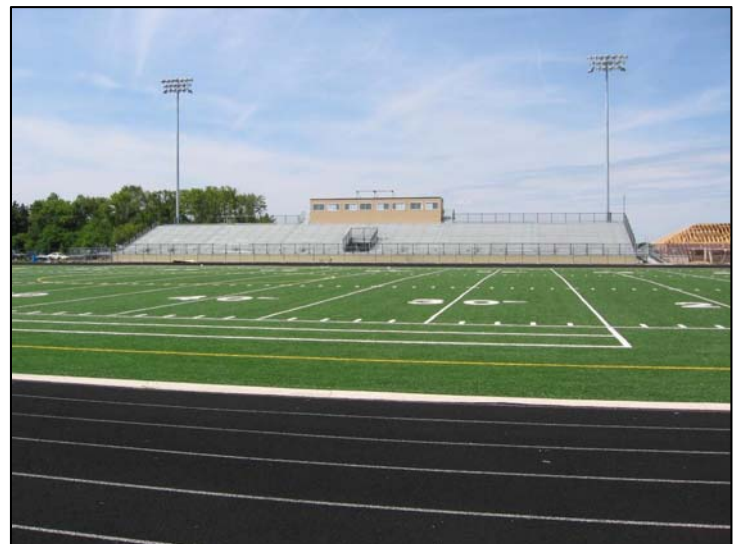
Jaskwhich Field & Grandstand

**** Half Day Events are defined as events lasting five (5) hours or less, and do not fall under the categories listed above.