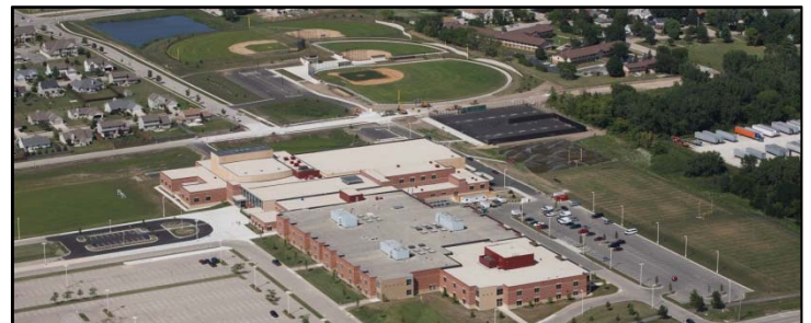
Baseball & Softball Fields at Indian Trail

AN ADDITIONAL CHARGE OF $100 WILL BE ASSESSED IF THE ORGANIZATION DOES NOT CLEAN UP AFTER USING THE RENTED AREA(S)